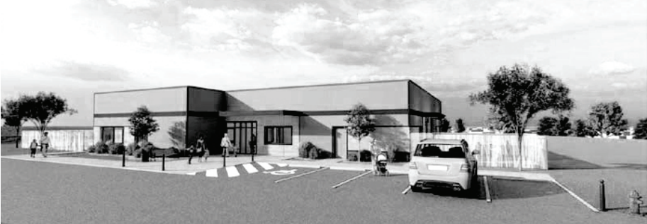
Illustration of the new child care centre slated for Mac 1 park.

fire hall. The report says the project has remained within the original approved budget, however concrete will not be available locally during the completion steps and will have to be brought in from Prince George. This will add $27,920 over the budget, which the report says will be allocated from the Northern Capital & Planning Grant Reserve. No details were provided as to what, if any, penalties were applied in the contract termination. The fire hall project, with a budget of $6.5 million, funded by a provincial Northern Capital & Plan- ning Grant, has been plagued with delays since its start in 2020 with an original scheduled completion date of Fall 2021. Southwest has been involved in a legal dispute with its subcontractor Terotech since spring of 2023. Did you know? A theme park in France has trained crows to pick up discarded cigarette butts off its pathways and public squares. The crows at Puy du Fou park search the ground for butts and other small trash items, depositing them into a little box and receiving a treat each time in exchange.