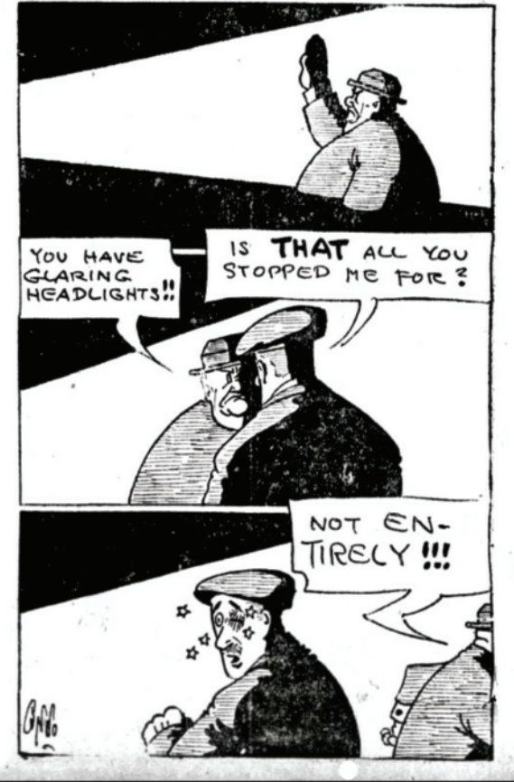
The Outbursts of Everett True was published from 1905 - 1927.