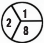
Figure out the formula and guess the missing numbers.