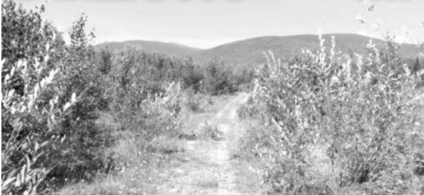
Undeveloped trail between the golf course and Morfee campground, 2022.