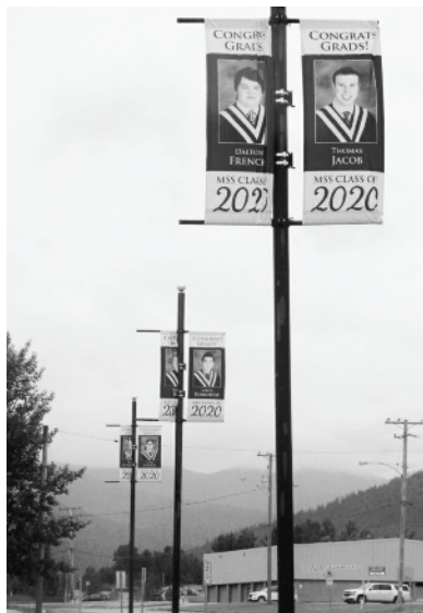
The MSS Grad 2020 banners went up June 22 at the Rec Centre and on Skeena Drive.